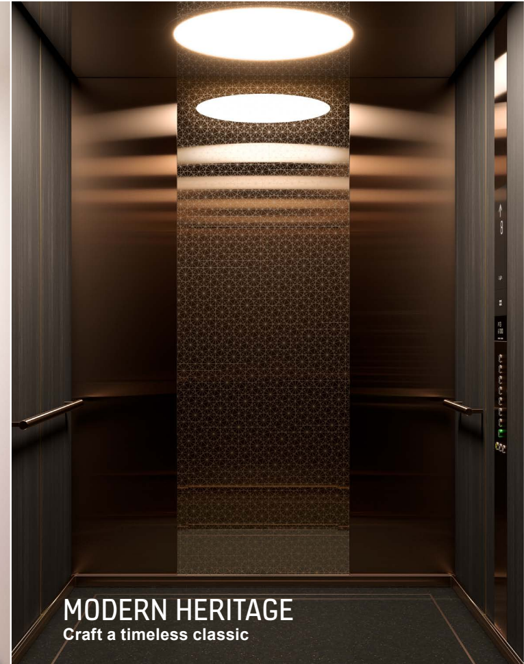
MODERN HERITAGE Craft a timeless classic