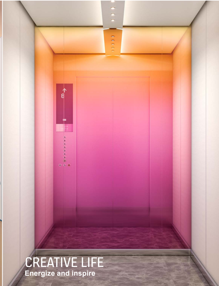
CREATIVE LIFE Energize and inspire