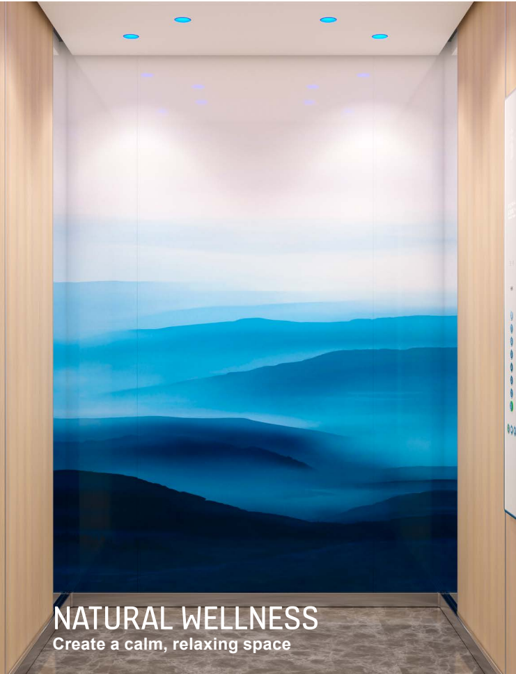
NATURAL WELLNESS Create a calm, relaxing space